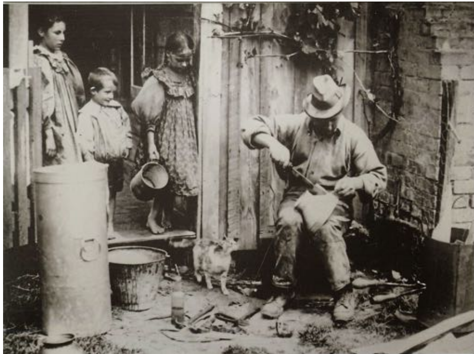
Waste not want not